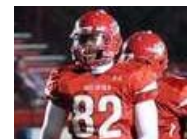
ISU football recruiting class