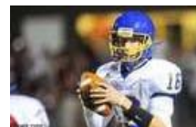
Iowa football recruiting class